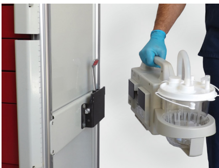
Easily Attached to Walls or Carts

The SSCOR Duet with Mounting Bracket is specifically designed to conserve the valuable real estate of the crash cart work surface.