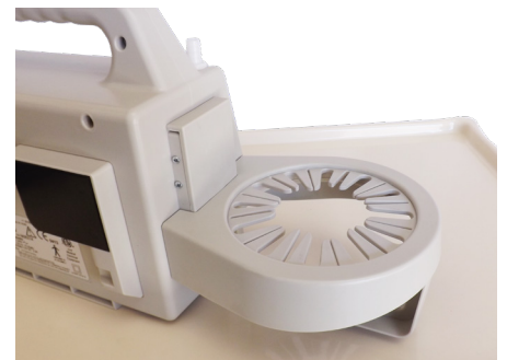
Universal Canister Holder