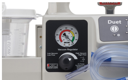
Powerful and Portable With adjustable vacuum.