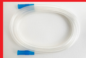
#43200 - 6 Feet

For best results, use SSCOR #43200 OR #43203 patient connecting tubing. Both have a large internal diameter similar to the SSCOR DuCanto Catheter.