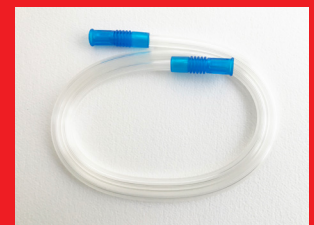
#43203 - 3 Feet